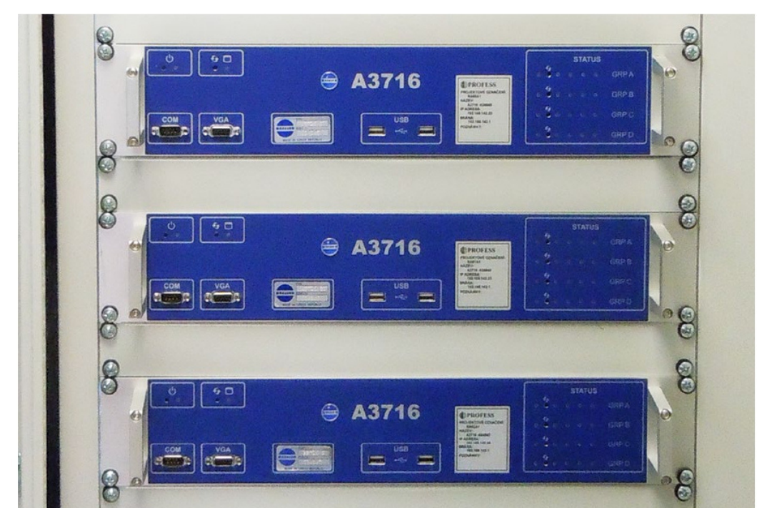
Example of use - 3 pieces of A3716 2U

The A3716 module contains 16 AC, 16 DC and 4 TACHO inputs. All channels are measured simultaneously. The A3716 modules can be easily combined to create a system with more channels.